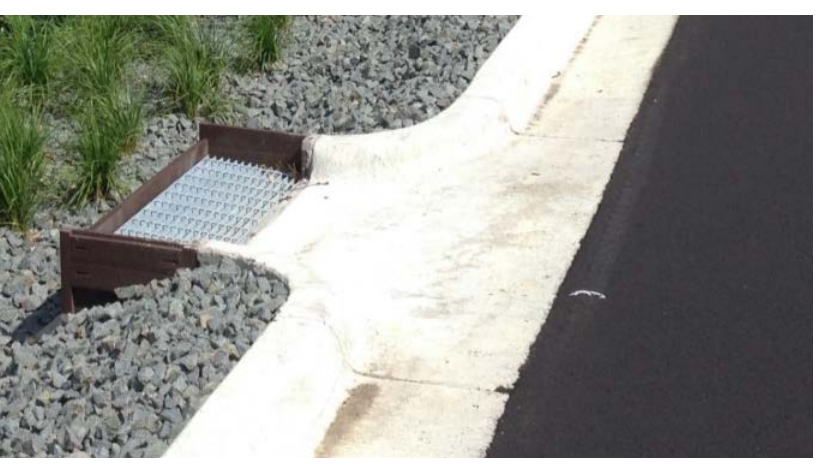
EXAMPLE OF RAIN GUARDIAN INLET STRUCTURE