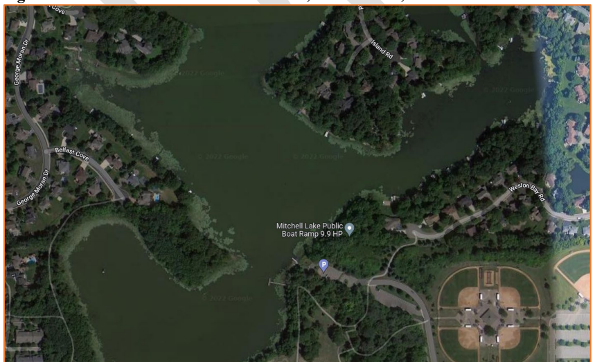
Figure 6 – Mitchell Lake Public Boat Launch, Eden Praire, MN