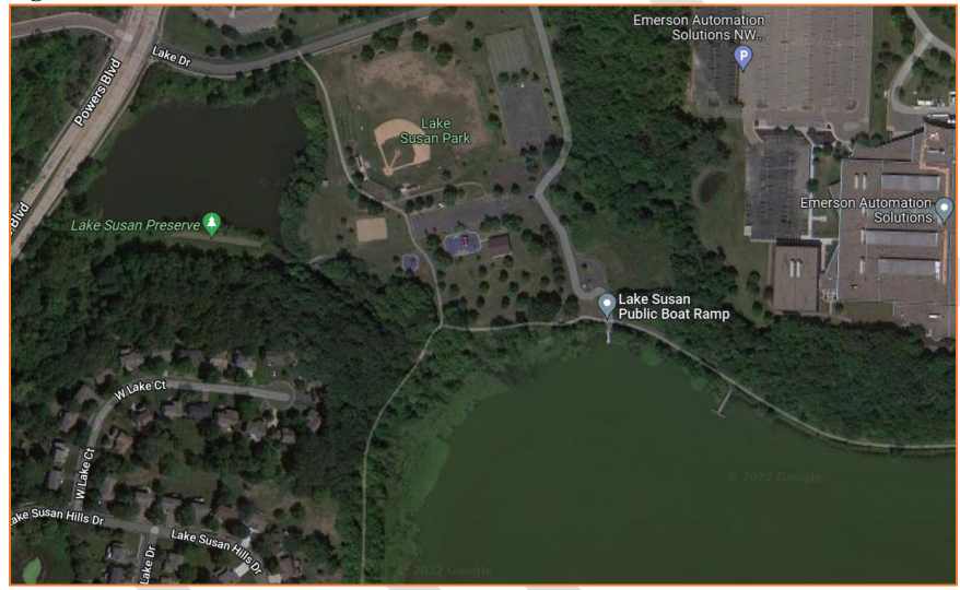
Figure 5 – Lake Susan Public Boat Launch, Chanhassen, MN