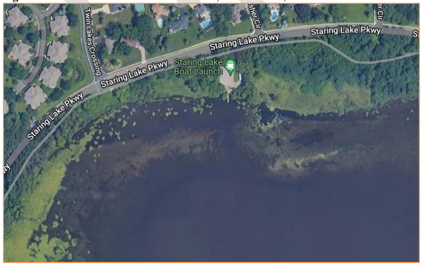
Figure 3 – Staring Lake Public Boat Launch, Eden Prairie, MN