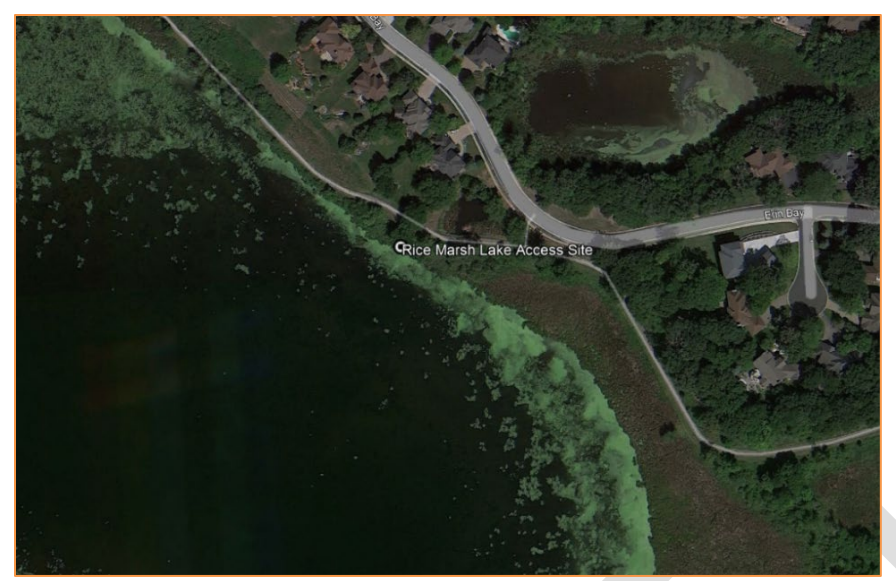
Figure 4 – Rice Marsh Lake Launch Site, Eden Prairie, MN