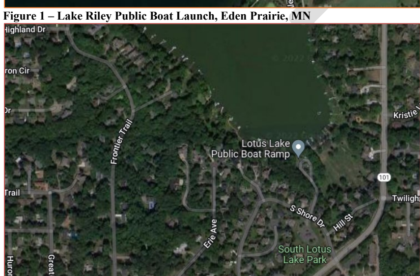
Figure 2 – Lotus Lake Public Boat Launch, Chanhassen, MN